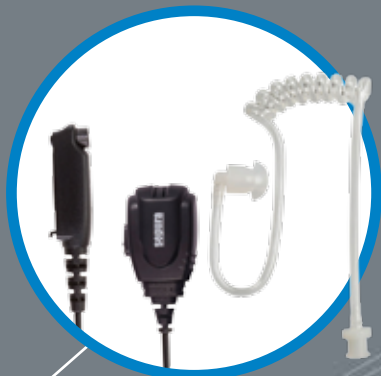
TWO-WIRE ACOUSTIC TUBE EARPIECE WITH IN-LINE PTT