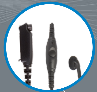
ONE-WIRE EARBUD WITH IN-LINE PTT