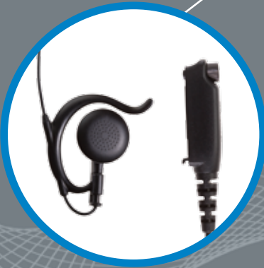
ONE-WIRE EAR HANGER