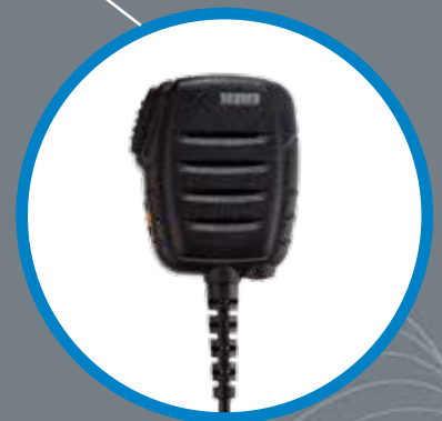
REMOTE SPEAKER MICROPHONE