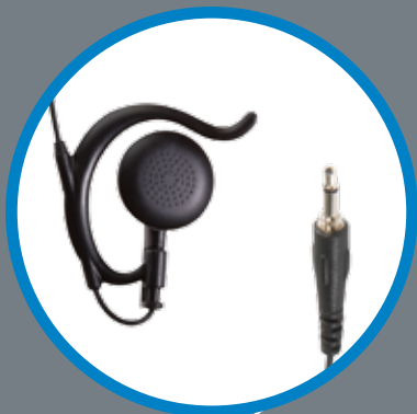
EAR HANGER EARPIECE FOR RSM